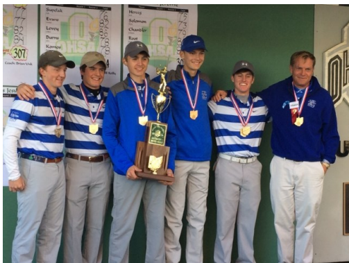
2016 State Champions